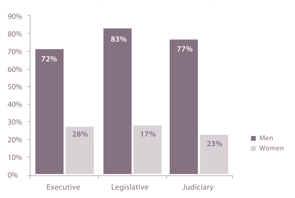
Chart No. 6. Participation in public management positions in the Executive, Legislative and the Judiciary, 1981